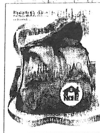
Parent Pack Pocket Folder